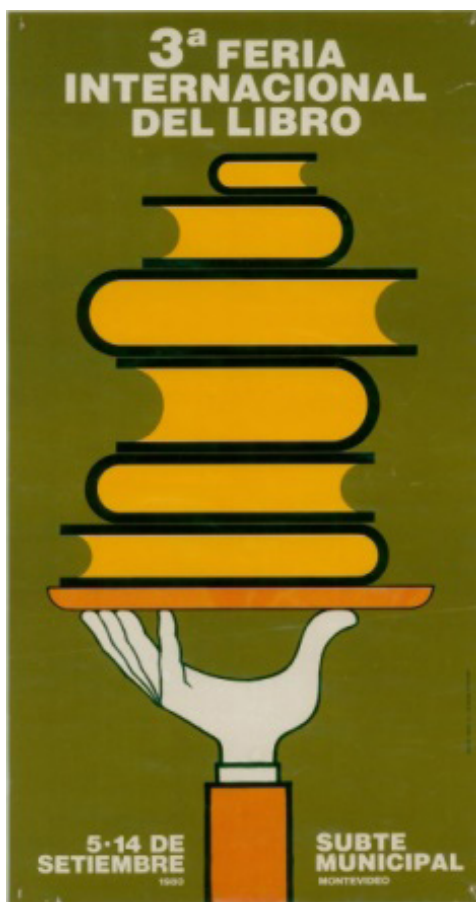
Figure 4. Poster for the 3a. Feria Internacional del Libro (1980), Colecciones Digitales, Biblioteca Nacional.

reference system of traditional representation, promoting the search for new forms of expression. With a constant concern for the material aspects of edition, the fair established a crossover between the arts and a special balance between literature and the plastic arts, with which it was identified into the 21 st Century (Figure 4). 55 Its startup coincided, also, with the launch of the illustrated poetry magazine, which would later become the publishing company 7 Poetas Hispanoamericanos (7PH) (7 Spanish-American Poets), which proposed a clear aesthetic posture towards poetry creation (Figure 3).