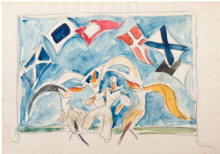
Figure 2. Rafael Barradas, Study, c.1918, watercolor and pencil, paper, 23 x 32 cm, National Museum of Visual Arts (Inventory No.: v).

Although this momentum was attenuated during the process of institutional rupture that took place between 1973 and 1985, in those years drawing also experienced a brief and rapid flourishing that broke with some of the predominant naturalistic tendencies of the 19 th century. 40 Initially, these manifestations were mainly expressionist and achromatic, with an often “monstruous” and very detailed figuration, to later give way to a broader field of personal languages and styles. In every case, however, they shared a high technical and aesthetic level, as well as a strongly antiestablishment character, in the sense of the use of new codes to express contents linked to the social environment. As described by Jorge Abbondanza: “the plastic artist thus became a messenger, rendering his tools in the service of an allusive function and a metaphoric reach that accompanied the -certainly infuriated- moods the people experienced on the street, as the country faced more and more tension and could be headed to a multiple crisis (political, economic, social, cultural), from which it would emerge laboriously a long decade later”. 41