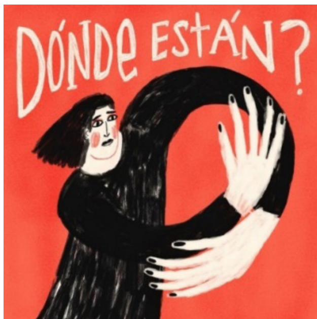
Figure 5. "Where are they?," illustration by Daniela Beracochea for the II March of Silence organized and convoked by Mothers and Relatives of Uruguayans Detained-Disappeared (1997).