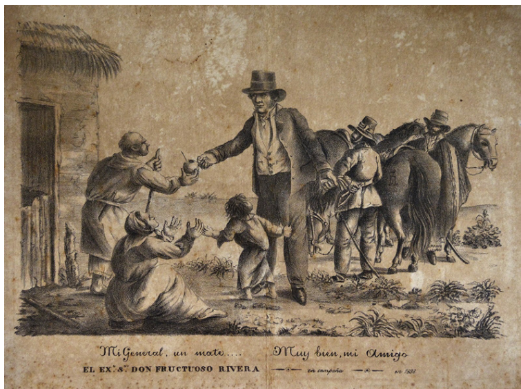
Figure 1. Juan Manuel Besnes e Irigoyen, “Mi general... un mate. Muy bien mi amigo. El Excelentísimo Señor Don Fructuoso Rivera en campaña”, 1838, lithography on paper, 43,3 x 41,7 cm, Museo Histórico Nacional.

In the late 19 th Century engraving “gradually and imperceptibly lost artistic hierarchy in the scale of social worth, when it was almost exclusively devoted to the service of publicity monograms and commercial labels”. 8 But in the early decades of the 20 th Century, this trend somehow managed to be reverted in the editorial field, where some of the experiences connected to the European vanguards were channeled. 9 During those years, magazines such as Pegaso (1918-1924), Los Nuevos (1920-1921), La Pluma (1927-1931), Vanguardia (1928), Cartel (1929-1931), Alfar (1926-1955) and La Cruz del Sur (1924-1931) 10 became the quintessential mass media of cultural activity 11 and renowned local painters actively contributed in book illustration, as well as in graphic press, caricature, poster and theater set design. 12