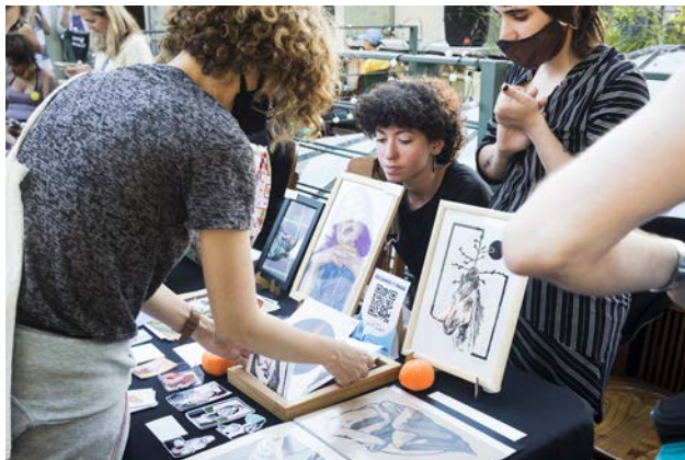
Figure 6. Micro-utopias – Montevideo Printed Art Fair (2021).

Finally, the pandemic exposed many social problems that already existed, renewing the role and potential of graphic expressions as insurgency tools. Secluded in their homes, many artists had time to reflect, resume their own projects, and deepen their authorial production, apart from commissioned works. In many cases, what happened is what Dani Scharf defines as a “greenhouse effect in which one’s own projects, and through virtuality, one’s connections with others blossomed”, 83 the fruits of which – of a more experimental, interdisciplinary and powerful nature – are beginning to be observed only now in the networks, fairs and encounters. From this point of view, the sector has not stalled its development, has not come to a standstill, but in the frame of the pandemic, some of its facets have slowed down and eventually changed course.